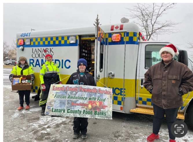
Lanark County Food Drive