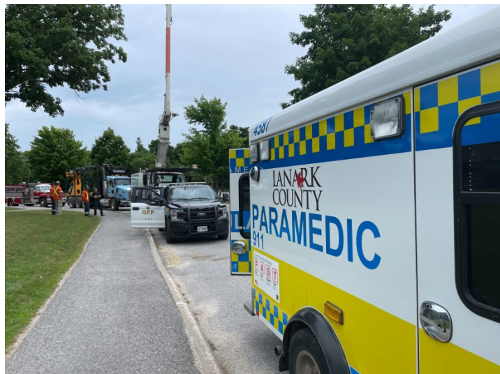
Touch a Truck Events