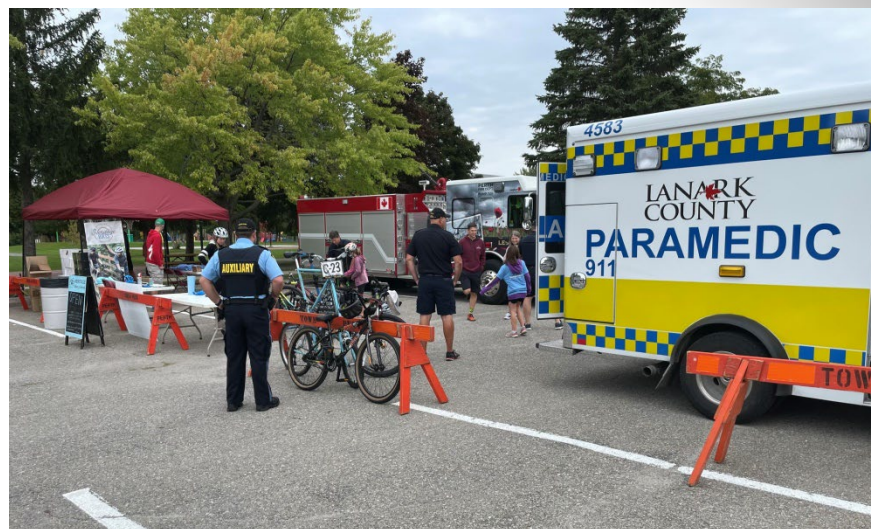
Bicycle Safety Rodeo